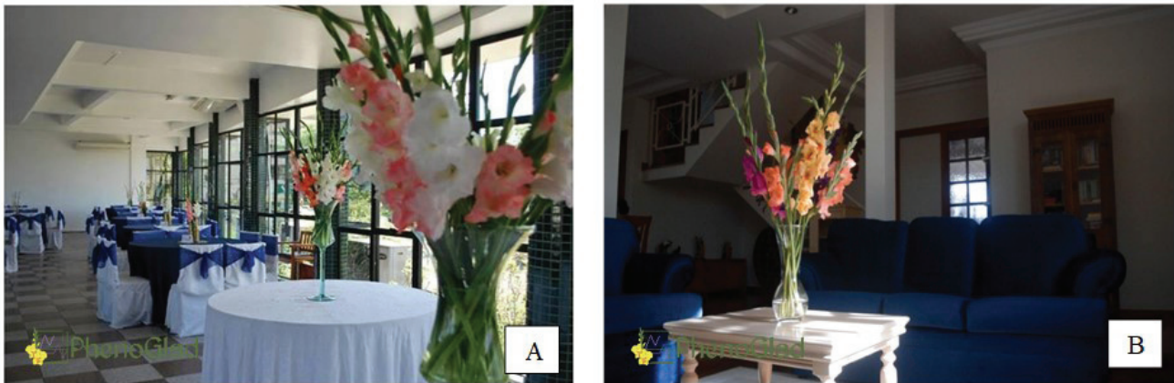
Figure 1. Different uses of gladiolus flowers stems: events ornamentation (A), and interior decoration (B).

The cultivation of gladiolus or Palma-de-Santa-Rita ( Gladiolus x grandiflorus Hort.) has potential for expansion in RS, since it is easy to implant and manage, the crop adapts to the edaphoclimatic conditions of the state and can be cultivated in open field, reducing production costs, attractive features for the small family producer. In Brazil, All Souls' Day is the main date for the commercialization of gladiolus (Schwab et al., 2015a) and, because of this cultural factor, many farmers believe that cultivation of this species is possible only in late winter and early spring (July, August and September). However, the late summer and early autumn (February, March and April) is also a suitable period for the production of quality flower stems (Schwab et al., 2015b). In the RS, the demand for gladiolus has been increasing in different celebratory dates, such as Mother's Day, Women's Day and also for the ornamentation of interiors, parties and events (Schwab et al., 2018). These different forms of use as cut flowers are shown in Figure 1.