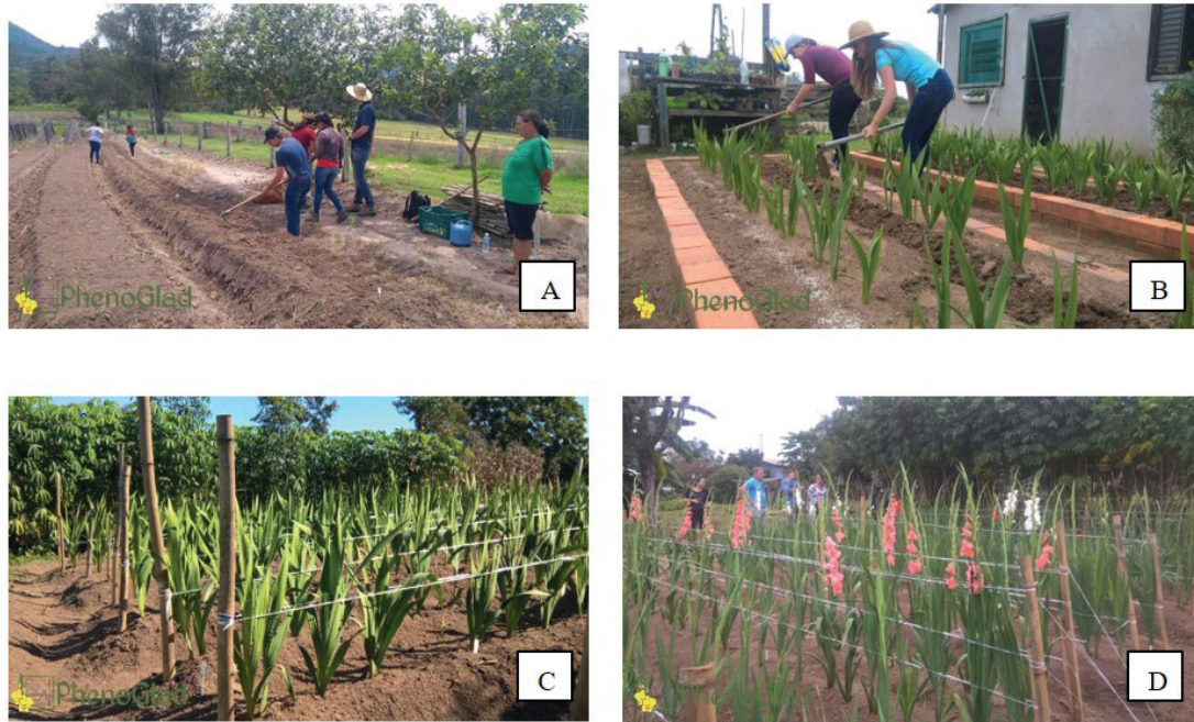
Figure 3. Technical visits to the gladiolus farms when were carried out planting (A), nitrogen fertilization, about 30 days after planting (B), support plants vertically with plastic net, about 60 days after planting (C) and harvest, about 80 days after planting (D).

As not all plants reached R2 on the same day, as the flowering period occurs within 15 days, farmers took the first stems to the fair one week before Mother's Day. An alternative for farmers with cold rooms in the property is the storage of the stems at low temperatures (approximately 6°C) to delay the opening of the florets until the day before the day of sale (Schwab et al., 2015b). However, since none of the farmers had a cold room, they started marketing at the fairs about a week before the intended date, using them as an attraction for consumers to return to the fair next week to buy flowers for Mother's Day.