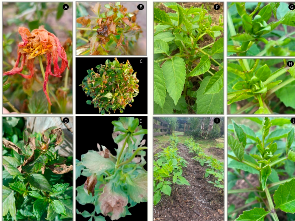
Fig. 4. Damage caused by cold temperatures in dahlia plants cultivated in the field in three locations in Southern Brazil after the first frost event of 2024. All plants were at the reproductive phase at the time of the event (A, B, C) in Santa Maria, showing necrosis and mummification in buds and leaves; (D, E) in Jaguari, highlighting severe necrosis and tissue discoloration; and (F, G, H, I, J) in Esteio, where the plants were at the vegetative phase remained healthy, with no visible symptoms of cold damage.

Low temperatures also trigger an increase in reactive oxygen species (ROS), which can further compromise cell integrity, requiring plants to activate antioxidant defense mechanisms to mitigate oxidative damage. Such responses have been observed in other cold-stressed species, such as Setaria viridis , where enhanced antioxidant activity played a crucial role in reducing cellular injury (Carvalho et al., 2022; Kolupayev et al., 2022).