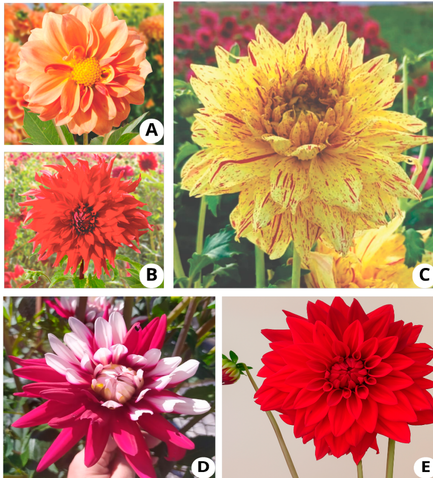
Fig. 2. Dahlia ( Dahlia variabilis Desf.) cultivars (A) Carla, (B) Marina, (C) Vicent Vans, (D) Rebecca's World, and (E) Frantônio used in field experiments conducted in three municipalities in the state of Rio Grande do Sul, Brazil, during 2024.