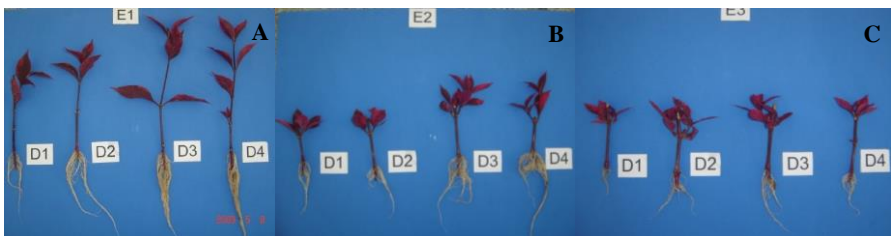
179 Fig. 3. Effect of AIB on rooting cuttings: apical (A), median (B) and basal (C) qwerty qwerty 180 qwerty qwerty.

Comentado [A18]: Figures must be inserted immediately after the citation in the text. Not after references. Figures must be minimum 8.5 cm wide, not exceeding 17 cm. The resolution must be of maximum quality with at least 300 dpi. Blurred and low-quality images will not be accepted.